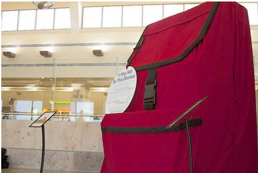
A 10-foot red backpack is part of the If You See Something, Say Something campaign in Orange County. Travelers who take their picture with it could win two Angels tickets. (Courtesy Keep OC Safe/ If You See Something, Say Something / August 1, 2013)